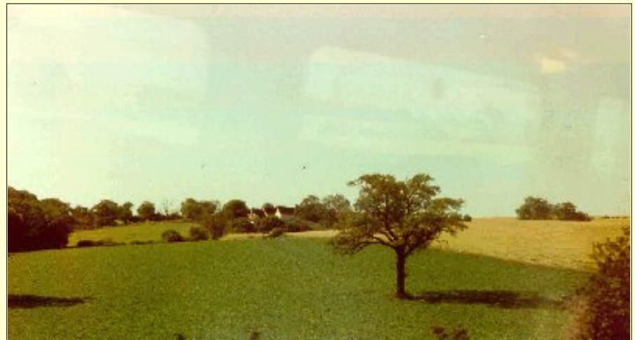
Countryside view from the train looking east toward Wherstead.

House at the crossroads, said to be over a hundred years old, just west of the church at Wherstead.